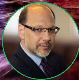
Howard Sapers, Correctional Investigator, Office of the Correctional Investigator, Government of Canada

ADRIC IS HOSTING THE IMI GLOBAL POUND CONFERENCE OCTOBER 15TH